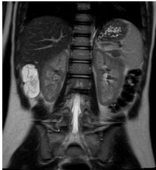
Figure 1: The T2 weighted MRI image of the liver in the coronal plane shows a single unilocular fluid containing cyst (36mm x 27mm x 51mm) in segment 6 of the liver, with an inner floating detached membrane, the so-called "water lily sign". No daughter cysts were identified.