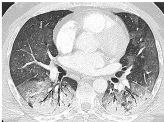
Image from CTPA of patient 2 showing diffuse pulmonary opacification demonstrating an anterior to posterior density gradient with diffuse ground-glass opacification in the anti-dependent portion