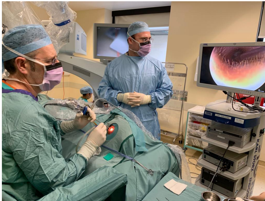
Figure 2: Endoscopic Ear Surgery set up.