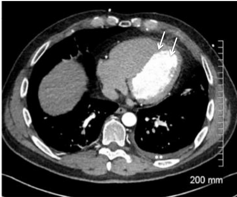
Figure 2. Axial CT scan depicts also left pleural effusion (asterisk) in addition to pericardial changes (arrows).